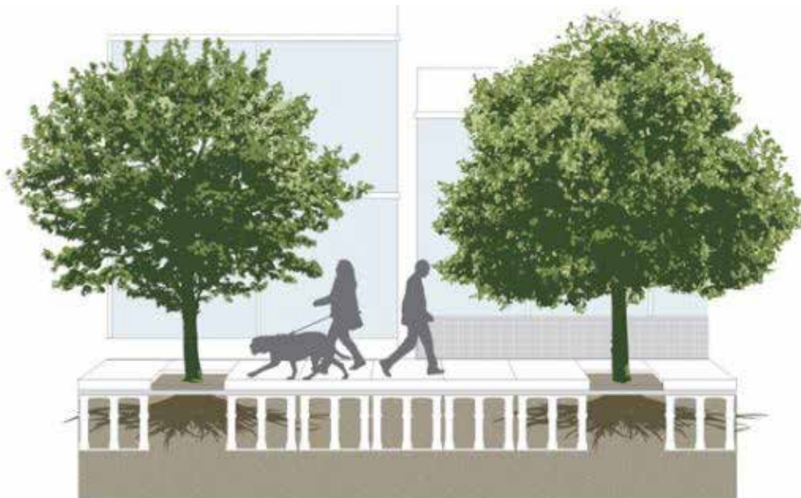
Figure 13.2.4 (b) Structural Cell Example