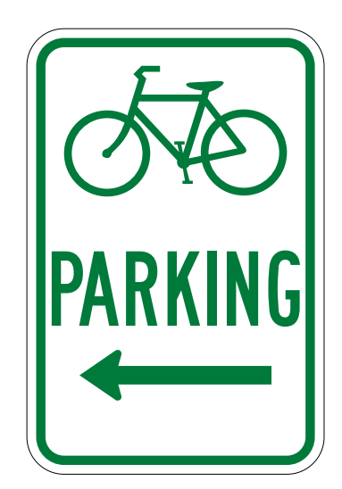
Figure 11.1.1 MUTCD Figure D4-3