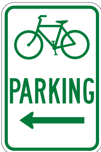
FIGURE 11.1 (b) MUTCD Figure D4-3